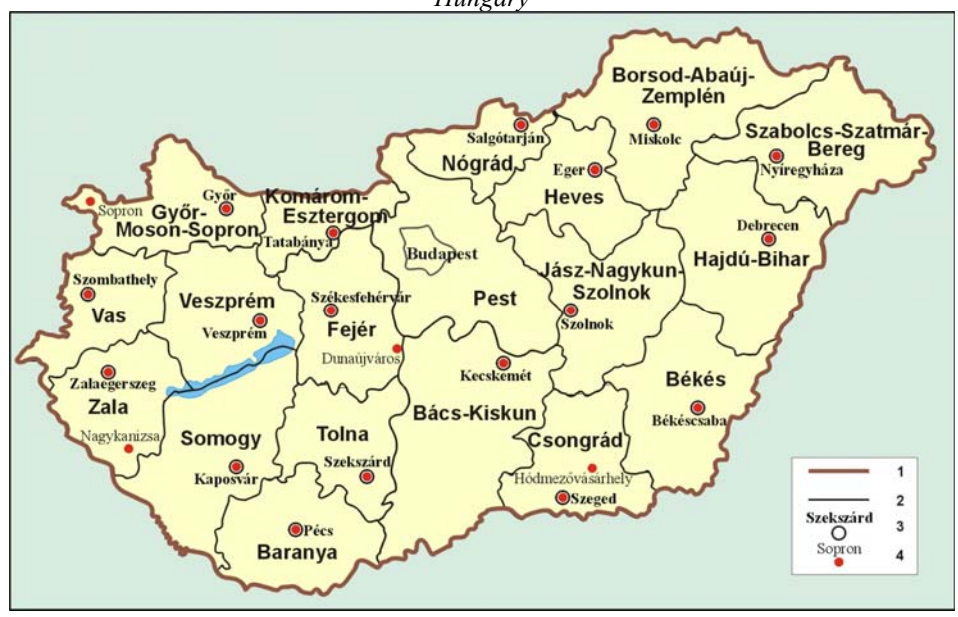
Key: 1– country borders, 2 – county borders, 3 – county seat, 4 – town with county rank