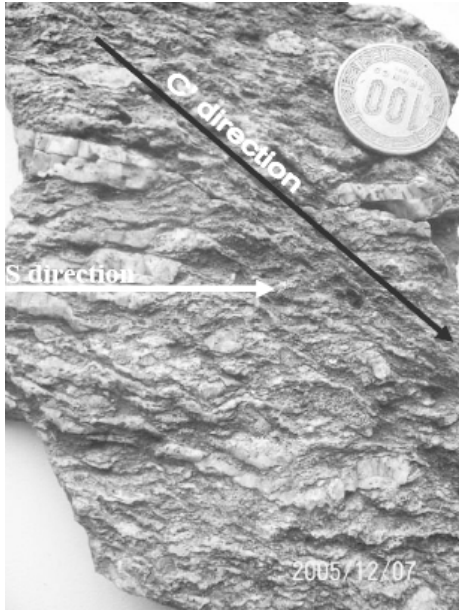
Figure 2: S/C' structure

These S/C' structures evolve with the intensity of the deformation; from the orthogneisses where they are observed, they pass to mylonites sensu stricto with S/C/C' structures (Fig. 1) and finally to the ultramylonites where one observes the S/C' structure in which C is parallel and confused with S (Fig. 2). The gradian of the deformation is marked by stretched crystals of quartz, by the reduction of the sizes and proportions of feldspar megacrystals. This has implications at the level of orthogeissification of structures, reduction of the angle between S and C, the increase in the density of C and the appearance of the C' plane, such that in the ultramylonites, S is almost parallel to C and the angle between C and C' attains its maximum.