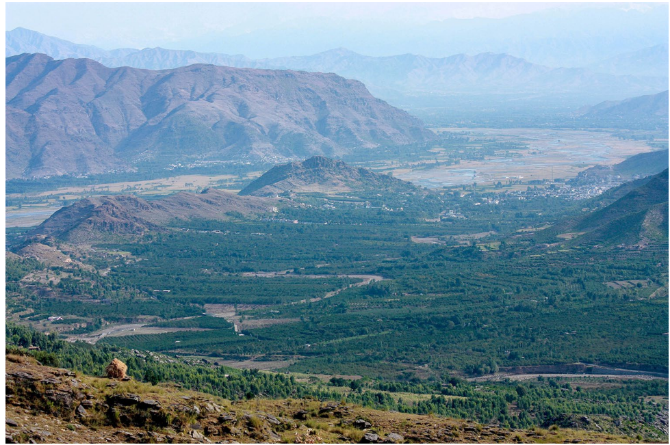
Fig. 2 The site of Barikot, its ager (surrounding land), and the middle Swat valley seen from the southwest

or Beira (Beira = Pakistani and Indo-Iranian va(y)ira and Bazira = Sanskrit vajra , Baums 2019) and in medieval sources as Vajirasthana (von Hinüber 2020). It was an Assakenian stronghold that was besieged and conquered by Alexander the Great in 327 BCE. The area was renowned in antiquity for its fertility; in historical sources the abundance of crops and the size of herds in this area were praised by Arrian of Nicomedia in the early second century CE (Brunt and Robson 1976–83, IV 25, 4). Curtius Rufus defined it as an urbs opulenta (rich city) in the first century CE (Atkinson and Yardley 2016, VIII 10, 22), the latter being a term clearly indicating agricultural wealth, which is otherwise very rarely used by the Roman historian and only applied to Tarsos, Babylonia, Persepolis and to Bactria (L. Prandi, personal communication). Previous archaeobotanical research in the Swat valley by Costantini (1987) included a section on earlier occupation layers at Barikot (ca. 1700–1400 BCE). The present work on Barikot represents the first large scale and systematic archaeobotanical study in this region; the data presented here reveal the agricultural system used across the mountain valleys and alluvial fans in the past; they also helps link ongoing discussions about South and Central Asia. By working on this site we can begin to fill in the gaps in our understanding of the spread of crops across the ancient world.