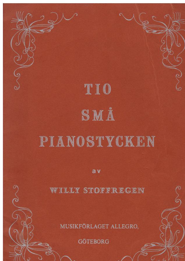
Figure 3. Title page of piano pieces composed by Stoffregen.

diodes and tetrodes were available and that cathode ray tubes for recording ionospheric echoes were very unreliable at that time. His pulse transmitter for ionospheric sounding (operating at 4 MHz with 500 W power) was apparently the first