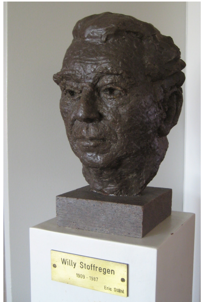
Figure 1. Bust of Willy Stoffregen in the library of the IRF.

In his later years Stoffregen devoted much time to his other great interest: music. Besides playing piano, he composed classical piano pieces (Fig. 3) in the 1970s (Stoffregen, 1974a), which were occasionally played on the radio in Scandinavia (A. Egeland, private communication, 2013). It