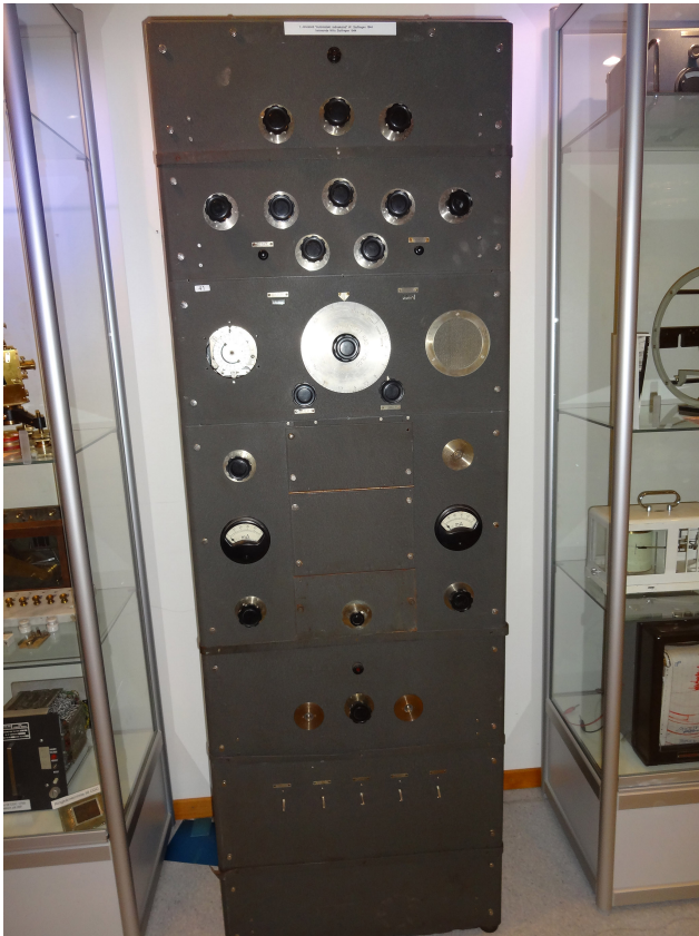
Figure 4. Ionosonde developed by Stoffregen.

by his own means. So he started to look for a suitable location in the vicinity of Uppsala. As the ionosonde operated on HF-frequencies, it was expected to interfere with radio broadcasts. Therefore it was important to find a place that was remote enough not to disturb neighbours, but still easily accessible from town. Having travelled around for some time, he came to a nice place about 8 km south of Uppsala centre. There he saw two beautiful girls lying in the sun with very little clothes on, and he immediately decided that this was the right place for his ionosonde (Willy's own words!). The ground belonged to the University of Uppsala and he managed to get hold of some land for his installation. So, in 1951 he started to build the station. With money from his own pocket he purchased an old container that had been used on a truck for transporting horses. This became his first lab and office and was later called 'Vita hästen' (white horse), as it was painted white. A wooden mast was erected for holding the delta antenna. In 1952, after some persuasion FOA took over responsibility for the ionosonde and its organisation".