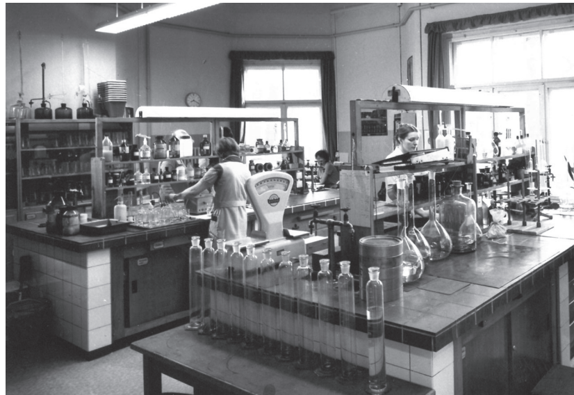
Figure 2. Laboratory for hydraulic soil physics in the “Pikardie” building in the Grand Garden of Dresden, a TU Dresden building around 1970.