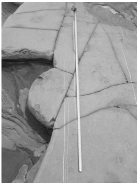
Figure 1: Measurement of the outcrop length l of data point 2 (see text)

Figure 2a shows the density contours of the strike and dip measurements in a Schmidt-net stereo projection (equal area, equatorial projection, lower hemisphere). The average fracture strike is 141.33 (N38.67W), the average dip is 84.33. From the strike direction we infer the orientation of the minimum principal compressive stress (maximum principal tensile stress), \sigma_3 , as being 51.33°. The average aperture (thickness) of the fractures is 0.159 m; the average length is 10.86 m.