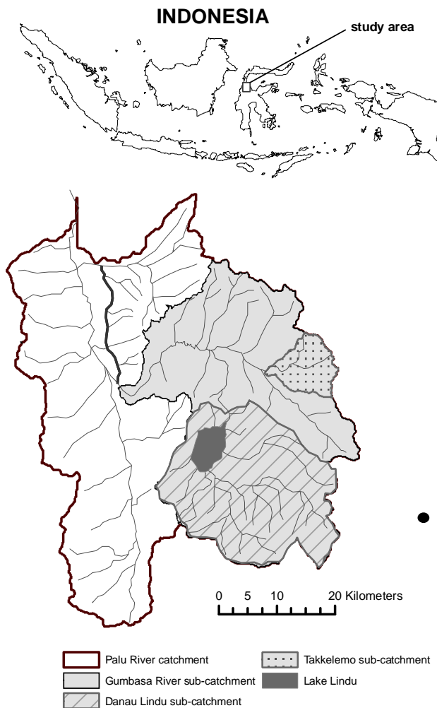
Fig. 1. The Palu River catchment and its sub-catchments, Central Sulawesi, Indonesia.

sample catchments to evaluate the overall influence of catchment characteristics on the water balance during normal and warm phase ENSO conditions.